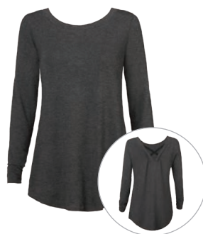
4007 ATC Cross Back Sweatshirt XS-XL USA 94 | CAN 114 | UK 72 p. 21