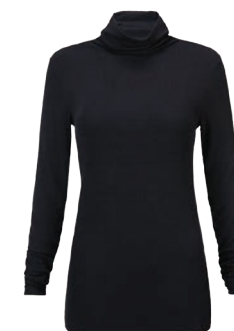
4006 Turtleneck Tee XS-XL USA 84 | CAN 104 | UK 66 p. 30