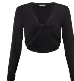
3997 ATC Layered Tee (top layer)