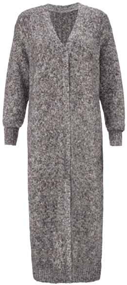
3881 Coffee Shop Cardigan XXS-XL ✕ USA 159 | CAN 199 | UK 124 pp. 16, 18