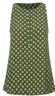
3985 Snap Top XS-XL USA 79 | CAN 99 | UK 62 pp. 8, 11