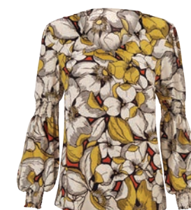
3954 Sequel Blouse XS-XXL ✖ USA 99 | CAN 119 | UK 78 p. 26