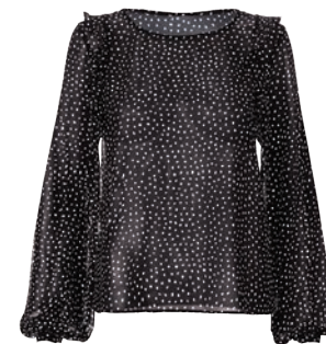
3956 Sinatra Blouse XS-XXL ✖ USA 79 | CAN 99 | UK 62 p. 23