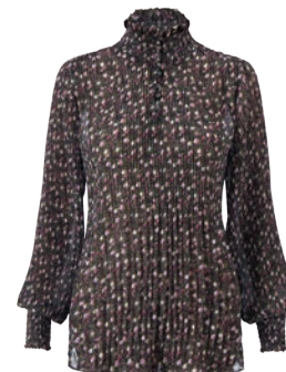
3952 Knife Pleat Blouse XXS-XL ✖ USA 119 | CAN 149 | UK 94 p. 16