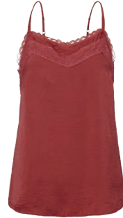
3976 All-Purpose Cami XS-XL USA 79 | CAN 99 | UK 62 pp. 23, 24