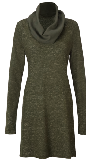
4016 Solace Dress XXS-XL ✖ USA 99 | CAN 119 | UK 78 p. 8