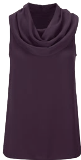
3978 Surround Top XS-XL USA 79 | CAN 99 | UK 62 p. 18