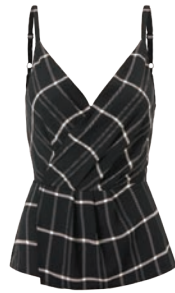
3986 Check Crossover Cami 0-16 USA 89 | CAN 109 | UK 69 pp. 12, 15

look for this icon to find beautiful items available in extended sizes