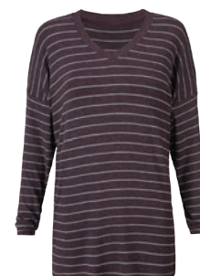
3998 Serenity Tee XXS-XL ✖ USA 84 | CAN 104 | UK 66 p. 18