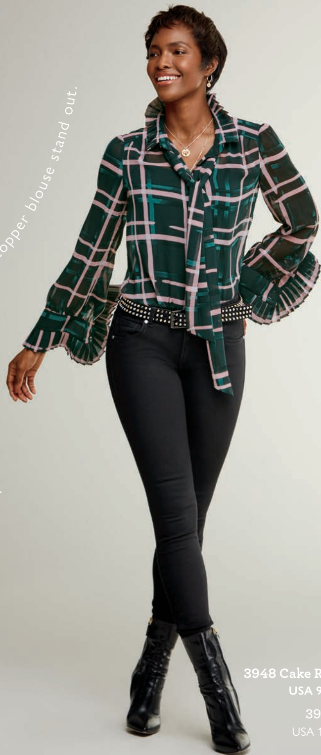
3948 Cake Ruffle Blouse XS-XL USA 99 | CAN 119 | UK 78

A simple base makes your showstopper blouse stand out.