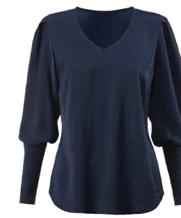
3959 Timeless Blouse XS-XL USA 89 | CAN 109 | UK 69 p. 6