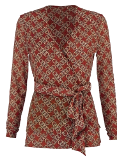
3951 Ringleader Wrap Top XS-XXL ✖ USA 99 | CAN 119 | UK 78 p. 27