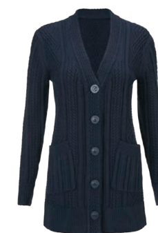
3882 Slant Pocket Cardigan XS-XL USA 129 | CAN 159 | UK 99 p. 5