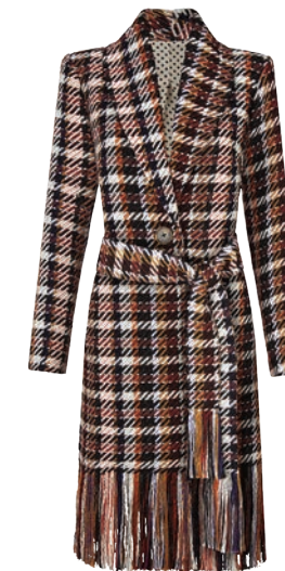
3901 Regency Coat XS-XL USA 299 | CAN 369 | UK 234 pp. 12, 14

can't remember where you saw that lovely item ? check the page number!