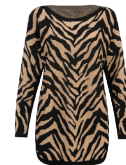
3884 Dani Pullover XXS-XL ✖ USA 109 | CAN 139 | UK 84 p. 13