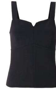
4011 Under Over Tank XS-XL USA 69 | CAN 89 | UK 54 p. 23