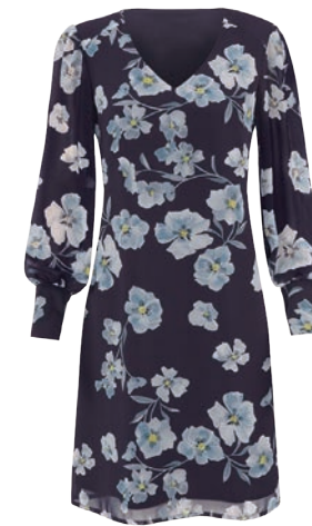
4018 Ellery Dress XXS-XXL ✖ USA 119 | CAN 149 | UK 94 p. 17