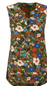
3981 Wild Flower Top XS-XL USA 79 | CAN 99 | UK 62 p. 9