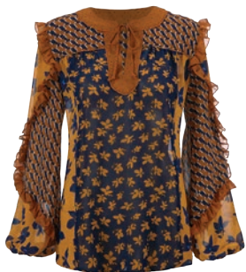
3953 Harmony Blouse XS-XL USA 99 | CAN 119 | UK 78 p. 5