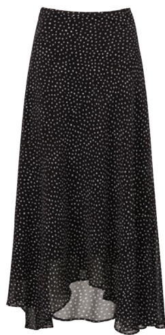
4024 Sinatra Skirt 0-16 USA 99 | CAN 119 | UK 78 pp. 23, 24