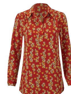
3947 Belfry Blouse XS-XL USA 89 | CAN 109 | UK 69 p. 8