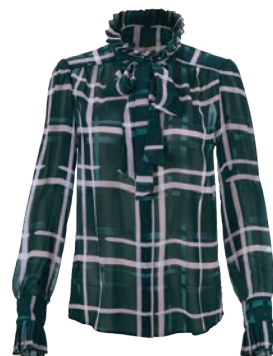
3948 Cake Ruffle Blouse XS-XL USA 99 | CAN 119 | UK 78 p. 32