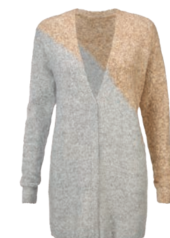
3886 Tilt Cardigan XXS-XXL ✖ USA 134 | CAN 169 | UK 104 pp. 27, 28