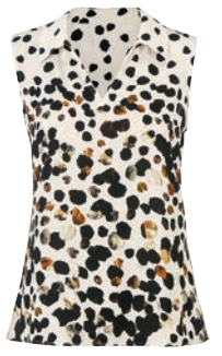
3989 Seismic Top XS-XXL ✕ USA 79 | CAN 99 | UK 62 p. 13