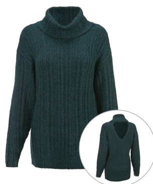
3885 Tryst Pullover XS-XL USA 119 | CAN 149 | UK 94 p. 31