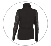
3911 ATC Jacket XS-XL USA 159 | CAN 199 | UK 124 p. 20