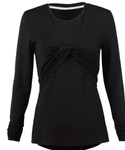
3997 ATC Layered Tee XS-XXL ✖ USA 109 | CAN 139 | UK 84 p. 21