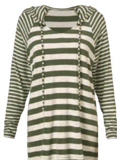
3995 Playoff Hoodie XXS-XL ✖ USA 109 | CAN 139 | UK 84 p. 10