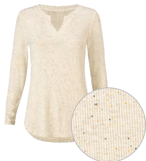
4003 Simple Tee XS-XL USA 84 | CAN 104 | UK 66 p. 28