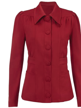
3906 Spencer Jacket XS-XL USA 169 | CAN 209 | UK 129 pp. 22, 24