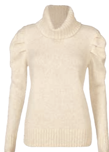
3889 Tuck Turtleneck XS-XL USA 109 | CAN 139 | UK 84 p. 26