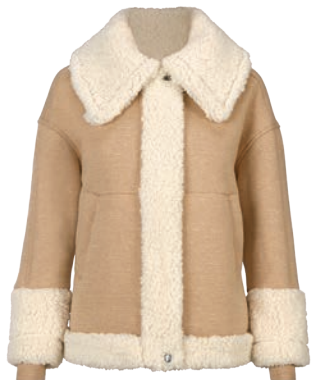
3908 McQueen Coat XXS-XL ✕ USA 169 | CAN 209 | UK 129 pp. 9, 10