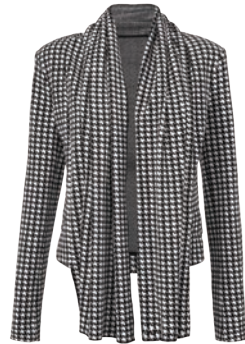
3904 Houndstooth Jacket XS-XL USA 149 | CAN 189 | UK 119 p. 30