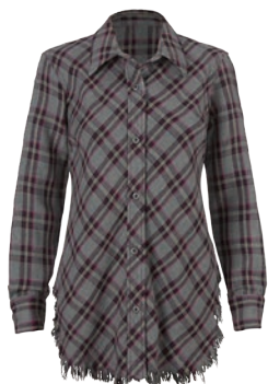
3946 Highland Shirt XS-XL USA 119 | CAN 149 | UK 94 p. 17