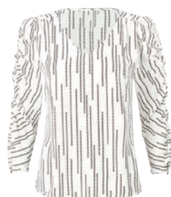
3958 Devoted Blouse XS-XL USA 89 | CAN 109 | UK 69 p. 31