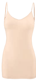
5067 V-Neck Cami (buff) XS-XL USA 36 | CAN 46 | UK 28