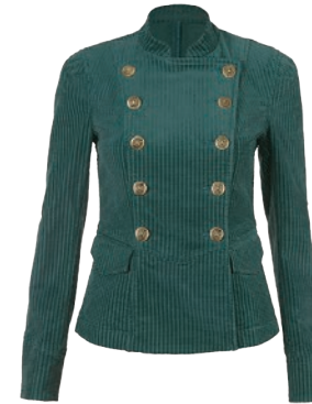
3913 Lennon Jacket XS-XL USA 159 | CAN 199 | UK 124 pp. 30, 33