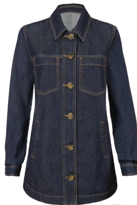
3910 Freedom Jacket XS-XXL ✕ USA 149 | CAN 189 | UK 119 p. 23