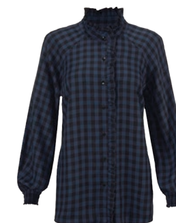
3961 Aberdeen Shirt XXS-XL ✖ USA 119 | CAN 149 | UK 94 p. 5