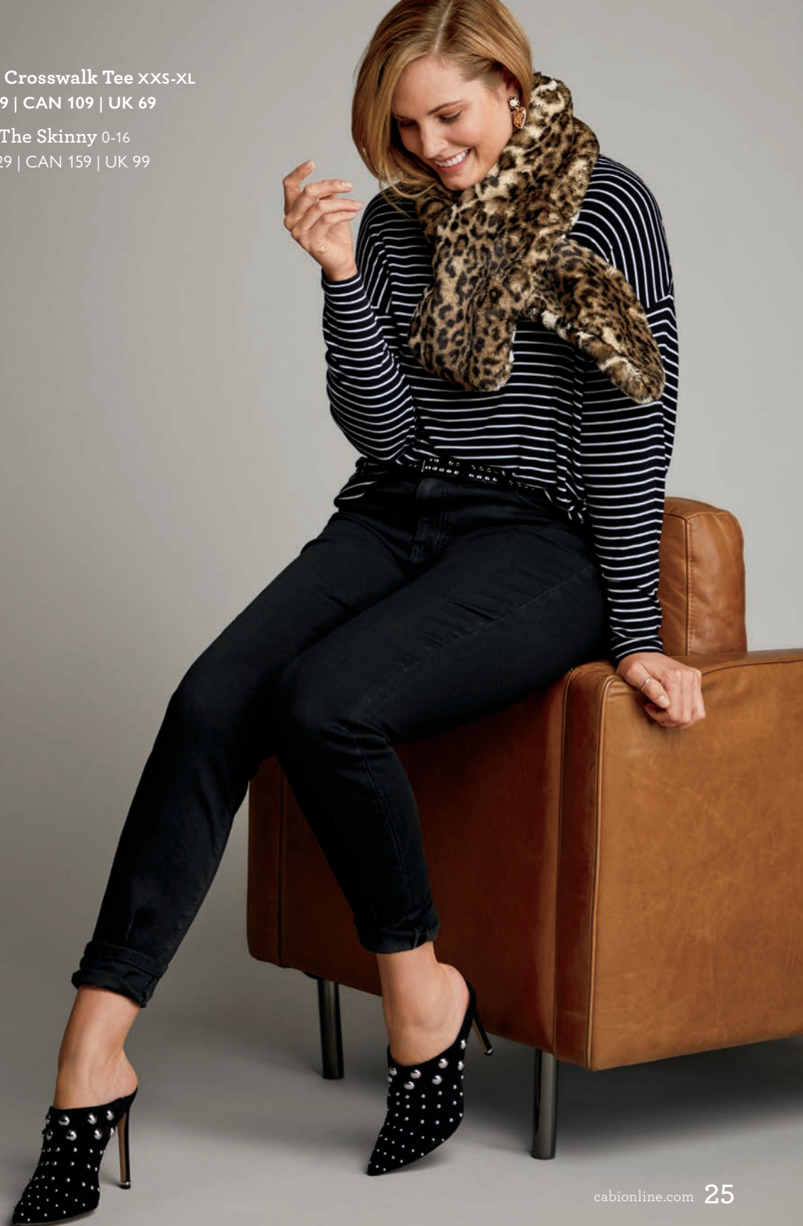
✕ 4005 Crosswalk Tee XXS-XL USA 89 | CAN 109 | UK 69 3941 The Skinny 0-16 USA 129 | CAN 159 | UK 99