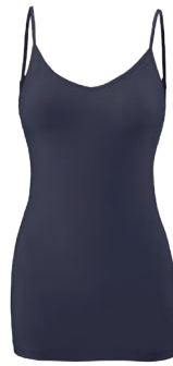
5067 V-Neck Cami (classic navy) XS-XL USA 36 | CAN 46 | UK 28 p. 4