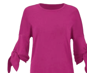
3887 Tether Pullover XS-XL USA 99 | CAN 119 | UK 78 p. 17