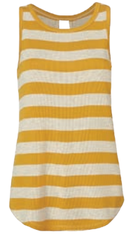
4010 Liner Tank XS-XL USA 76 | CAN 96 | UK 59 pp. 26, 29