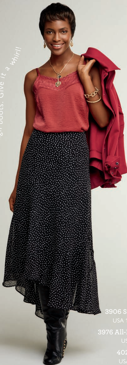
3906 Spencer Jacket XS-XL USA 169 | CAN 209 | UK 129 3976 All-Purpose Cami XS-XL USA 79 | CAN 99 | UK 62 4024 Sinatra Skirt 0-16 USA 99 | CAN 119 | UK 78

Long, flowy skirts are a seasonal must with knee-high boots. Give it a whirl!