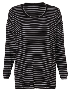
4005 Crosswalk Tee XXS-XL ✖ USA 89 | CAN 109 | UK 69 p. 25