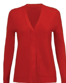
3888 Passage Cardigan XS-XL USA 99 | CAN 119 | UK 78 p. 8