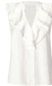
3979 Portrait Blouse XS-XXL ✕ USA 79 | CAN 99 | UK 62 p. 12