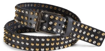
4031 Stud Belt XS-XL USA 119 | CAN 149 | UK 94 pp. 5, 8, 14, 17, 18, 19, 22, 23, 25, 26, 28, 31, 32