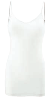
5067 V-Neck Cami (true white) XS-XL USA 36 | CAN 46 | UK 28