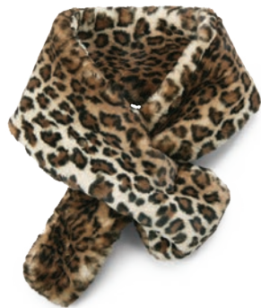
4029 Bundle Up Scarf USA 69 | CAN 89 | UK 54 pp. 5, 25