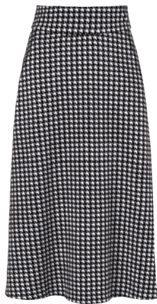
4023 Houndstooth Skirt 0-16 USA 99 | CAN 119 | UK 78 p. 31