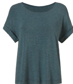
4008 Groove Tee XS-XL USA 76 | CAN 96 | UK 59 p. 33