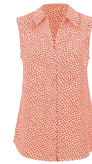
3982 Blossom Blouse XS-XL USA 79 | CAN 99 | UK 62 p. 23