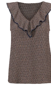
3983 Stellar Top XS-XL USA 79 | CAN 99 | UK 62 p. 17