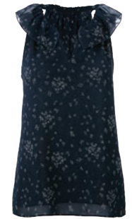
3984 Ever Top XS-XL USA 84 | CAN 104 | UK 66 pp. 4, 7