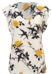
3963 Birdwatcher Top XS-XL USA 79 | CAN 99 | UK 62 p. 26