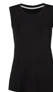
3997 ATC Layered Tee (bottom layer)