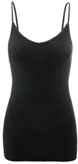
5067 V-Neck Cami (black) XS-XL USA 36 | CAN 46 | UK 28 p. 16