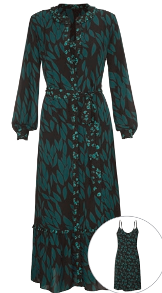
4017 Autumn Dress XS-XL USA 149 | CAN 189 | UK 119 p. 30