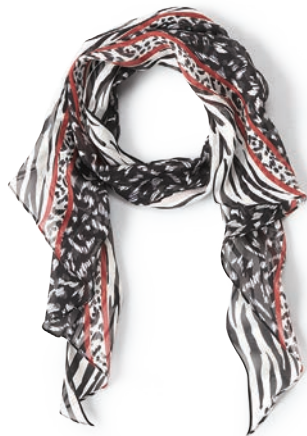
4030 Fable Scarf USA 54 | CAN 64 | UK 42 pp. 13, 23, 31