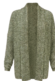
3892 Travel Cardigan XXS-XL ✖ USA 119 | CAN 149 | UK 94 pp. 8, 11