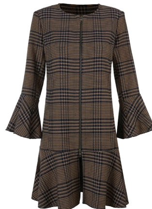
3902 Flounce Jacket XXS-XXL ✕ USA 179 | CAN 219 | UK 136 pp. 4, 6