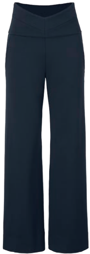
3920 Coco Trouser 0-16 (R/L) USA 129 | CAN 159 | UK 99 pp. 5, 6