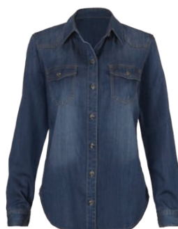
3944 Rebel Shirt XS-XL USA 129 | CAN 159 | UK 99 p. 19