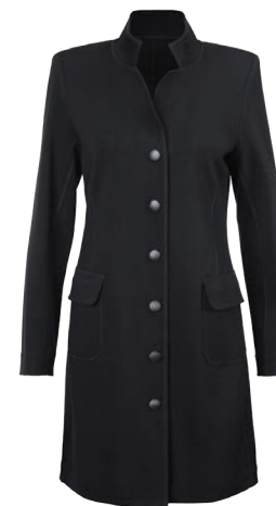
3903 Maestro Jacket XS-XXL ✕ USA 179 | CAN 219 | UK 136 p. 13