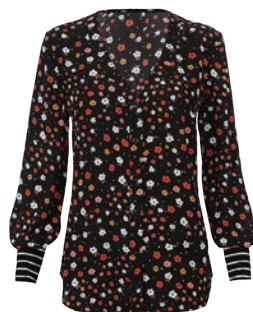
♥ heart of cabi item 3957 Cheerful Blouse XS-XL USA 89 | CAN 109 | UK 69 p. 22