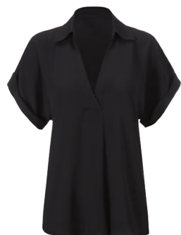
3964 Replay Top XS-XL USA 79 | CAN 99 | UK 62 p. 14