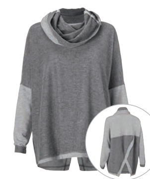
3996 ATC Cowl XXS-XL ✖ USA 109 | CAN 139 | UK 84 p. 20