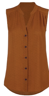
3988 Dotty Top XS-XL USA 79 | CAN 99 | UK 62 p. 5