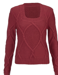
3883 Square Neck Pullover XS-XL USA 99 | CAN 119 | UK 78 p. 23