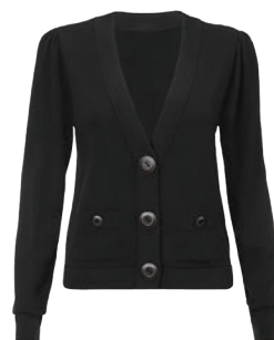
3891 Goals Cardigan XS-XL USA 99 | CAN 119 | UK 78 p. 12